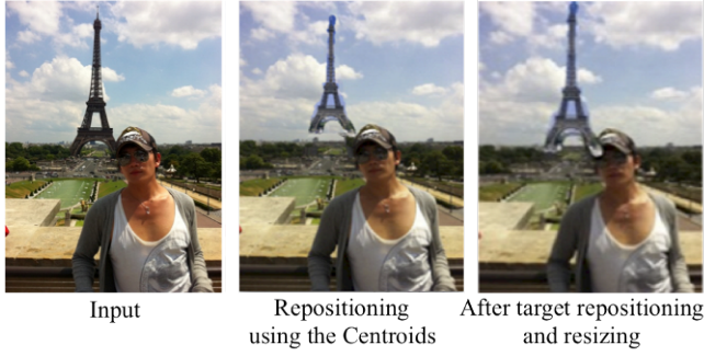
Figure 7. The results of different object positioning methods.

When transferring the segmented target from the reference to the input, we set the bottom line for positioning the object. The bottom line is the bottommost pixels at the target object and the object is aligned along this line. Instead of the bottom line, it is possible to match the centroid of template and target. However, this can result the positioned target to be at a different composition from the input photograph (Figure 7); the Eiffel tower located in the sky or the tower of Pisa abruptly obscuring the subjects in the background such as the tourist, trees or cars. Based on the various case studies using different methods, we find that aligning the template to the bottom line yields more reliable results. After repositioning the template, we resize the inserted template. We measure the distance between the top and the bottom pixels in the target and resize the inserted object to fit into the target size. This process guarantees that the inserted target is placed inside the frame.