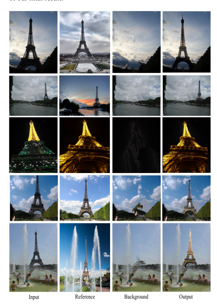
Figure 8. Example results of our approach to aesthetic enhancement. Input and reference images are composited together to create the output image..

When compositing the template into the input, both hole filling and gradient blending play important roles in reducing the seams along the object boundaries. In the fourth row, the background after the hole filling absorbs the textures from the surrounding ground and this degrades the quality of background. This adds some unreasonable textures at the bottom of Eiffel tower of our final result.