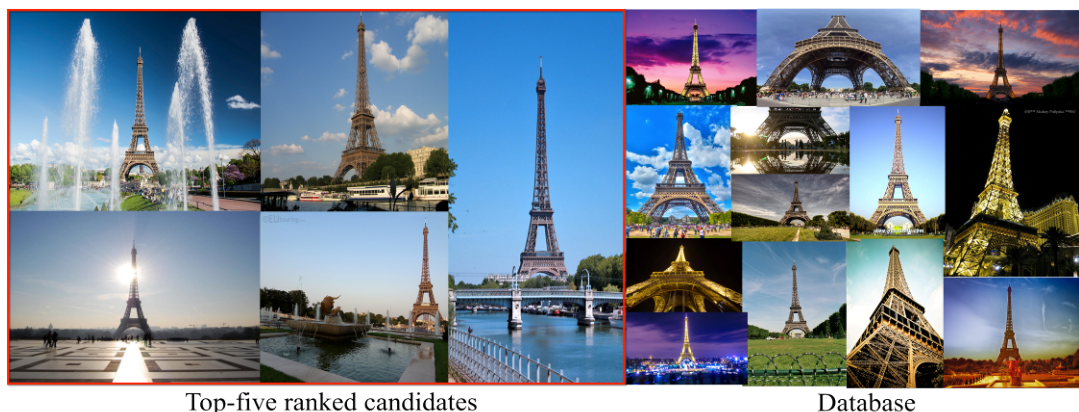
Figure 4. Input image and similar images retrieved from the database. In this paper, we concentrate on the images of "Eiffel Tower" leaving other landmark architectures out of consideration. Top five images are displayed and the user chose the reference image.

similarities between the template and target. To handle variable sizes of target objects, we resize the template within the range of maximum and minimum size and evaluate the matching cost in the sum of squared distance sense. The following pseudo-code describes our implementation on the hierarchical template matching.